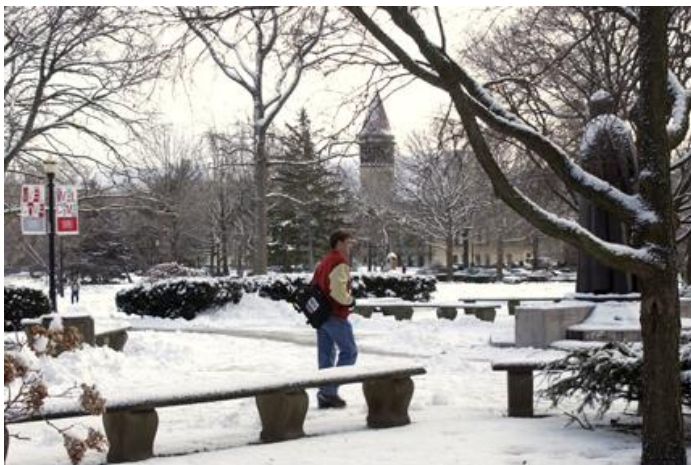
Snow, snow, snow...